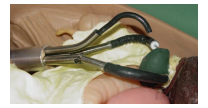
Figure 3. First application of the HVSPS for NOTES on the ELITE trainer performing a cholecystectomy using the transanal ISSA approach (abdominal wall removed)

The use of the additional transmural instrument is indispensable. Otherwise, sufficient exposition of some "difficult" regions to perform the necessary