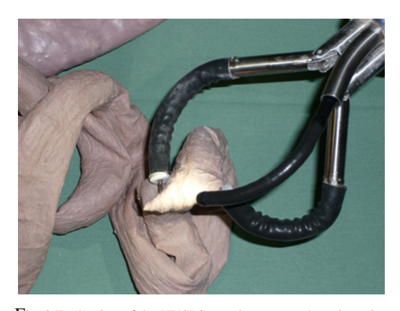
Fig. 3 Evaluation of the HVSPS on a human mock-up intestine

After several experiments we accomplished the first gallbladder dissection on the ex-vivo ELITE trainer under circumstances close to the real in-vivo cholecystectomy. More than two hours elapsed for accomplishment of the gallbladder dissection. This interdisciplinary training was indispensable for the intended in-vivo cholecystectomy in a swine experiment.