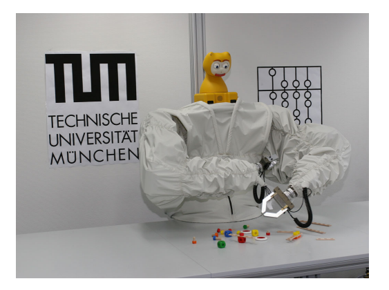
Figure 1: JAST construction robot