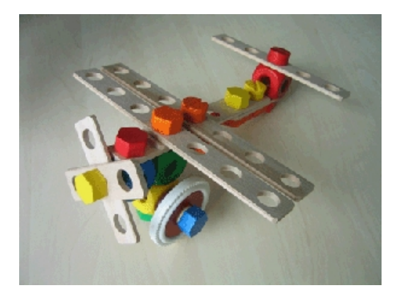
Figure 2: Assembled Baufix airplane

forms: for example, the robot may ask the user to provide assistance by holding one part of a larger assembly, or by assembling or disassembling components. In the current version of the system, the robot is able to manipulate objects in the workspace and to perform simple assembly tasks.