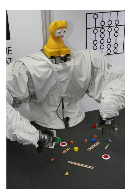
Figure 1: The dialogue robot

dicate the increased accessibility of the referent. This type of reference is similar to the placing-for actions noted by Clark (1996).