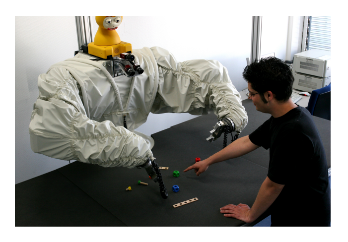
Figure 1: JAST/JAMES human-robot interaction system.

Keywords Human-Robot Interaction, Embodied Multimodal Fusion, Robot Roles