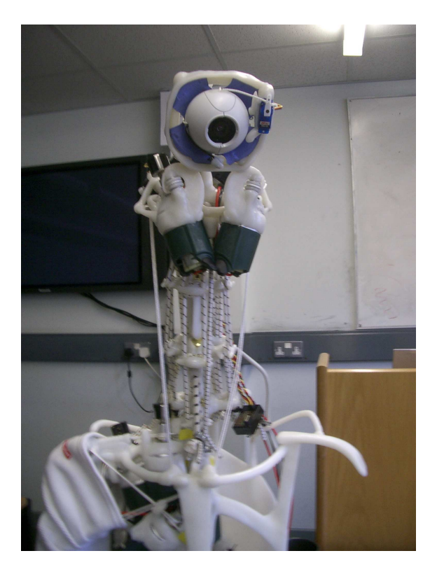
Figure 2: The prototype head and neck.

Figure 3 shows the first prototype of the torso and arm. The structure of the spine, which was purely passive at this stage, shows six vertebrae with rather exaggerated lateral extensions. Each vertebral joint was formed around a chromed sphere cast into one vertebra, and free to rotate within a matching cup in the other vertebra. The shoulder joint was quite a faithful rendering of the real thing – in fact, it could be dislocated in exactly the same way as a human shoulder – but did not include the shoulder blade. (The function of the shoulder blade is quite complex – see [] for what we believe is the only example of a robot with a correctly functioning but rather abstract shoulder blade).