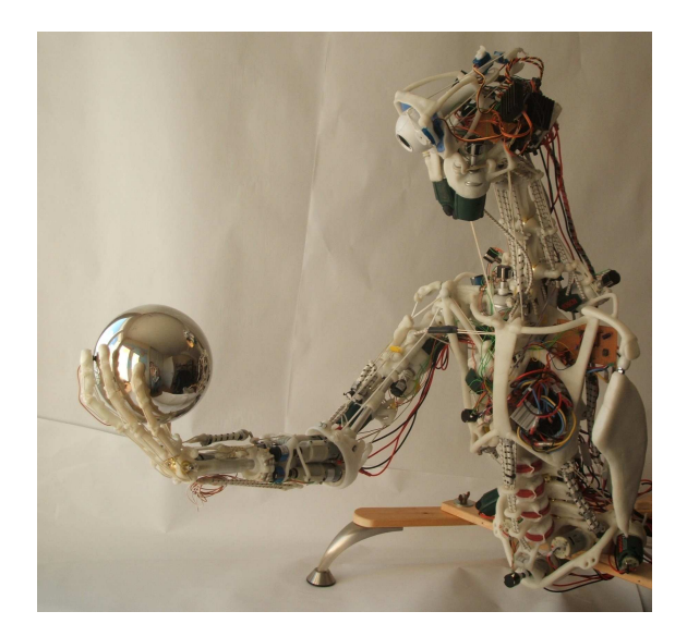
Figure 6: The head and torso with one arm fitted

Building on the knowledge gained from the early prototypes, a second prototype has now been constructed and is undergoing further development and testing. It is still limited to a torso, head, and arms (the second arm has not yet been attached in the figure). The original arm design has been modified. The first shoulder design seemed unnecessarily complicated, and so several engineering simplifications were made. The new arm is superior in almost all respects, but its range of movement is now rather limited in the vertical direction, and it is in the course of being redesigned to include some features of the original. The hand has also been redesigned, mainly because the prototype hand occasionally broke under load. In the original hand, each finger was formed by compressing softened Polymorph with an edge at suitable intervals to define each joint and to form a hinge. These hinges could not always withstand the forces imposed on them, and so in the new hand, two lengths of kiteline are moulded into the finger before the joints are formed, ensuring that each hinge is reinforced with two strands of Dyneema. There have been no failures since. Once again, this illustrates the suitability of Polymorph for this type of construction.