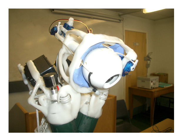
Figure 5: The prototype vision system

These problems are not simply to do with the difficulty of controlling such a redundant and flexible structure. The intention is that, like a human, the robot will be predominantly visual, and so it has been equipped with a visual system that is also anthropomimetic (Figure 5). However, it differs from humans in having a single central eye; this simplifies visual processing enormously, and can be justified by the fact that around 20% of humans do not perform stereo fusion, yet their performance on visual tasks is within the normal range. The imaging unit (currently a 640 x 480 colour webcam with a 25 degree field of view, shortly to be replaced by a specialist high resolution camera with a 90 degree field of view) is mounted in a model eyeball, and is moved by functional analogues of the six extraocular muscles, able to control rotation as well as pan and tilt.