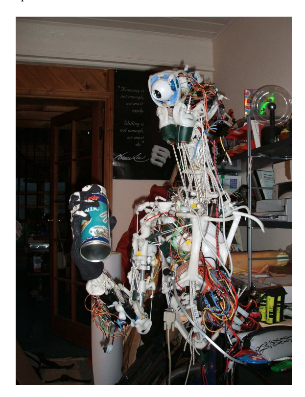
Figure 4: The first operational prototype, CRONOS.

the nature of an anthropomimetic robot came from the first system prototype, CRONOS, which com bined a torso, arm, and head. As can be seen from Figure 4, the sheer profusion of powered and unpowered tendons gives a strong qualitative impression of a biological system. This impression soon gives way to the realisation that the robot represents something qualitatively distinct from a conventional robot, even before it is powered up. You take his hand and shake it: it moves easily, and so does his whole skeleton. This multi-degree-of-freedom structure, supported by the tensions between dozens of elastic elements, responds as a whole, transmitting force and movement well beyond the point of contact. You take his arm and push it downward: the elbow flexes, the complex shoulder moves, and the spine bends and twists.