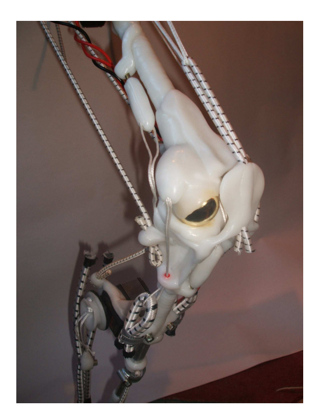
Figure 1: An early knee design using Polymorph

Many of the techniques developed can be seen in Figure 1, an early investigation of an unpowered knee joint. The upper half of the joint contains two large chrome balls embedded in Polymorph – one is clearly visible on the left. When the knee is straightened, the two balls rest in the moulded cups in the lower part of the joint, partly locking the joint to give some stability. As the joint rotates during flexion, the load is partially transferred to the moulded ball housing, and the joint becomes a rolling joint. The kneecap, or patella, is continuous with the lower part of the joint, but is thin enough to bend under the load of the tendon from the extensor motor. The termination of the flexor tendon can be seen on the left. The joint is held together by the tension transmitted through the tendon connecting the lower leg to the upper joint housing, and passing through a hardened insert moulded into the lower leg. It is clear that there are enormous differences between this type of joint and the conventional geared hinge joint forming most robot knees, and it is overwhelmingly likely that the functional characteristics of the joints will also be different. It may well be that the anthropomimetic knee is inferior to the engineered knee in many respects, but the point is that the anthropomimetic knee is a better representation of the control problem that the brain has to solve.