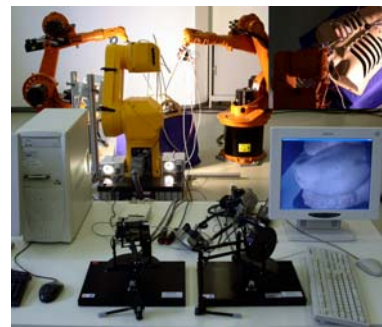
Figure 1: System Overview

Similar to other systems, our setup comprises an operator-side master console for in-output and a patient-side robotic manipulator that directly interacts with the operating environment. As shown in Figure 1, our system has one stereoscopic 3D-camera and two manipulators, which are controlled by two input devices. Each manipulator is composed of standard industrial robot that bears a standard surgical instrument. We developed an adapter to link the robotic arm with the instrument. The surgical instruments dispose of three degrees of freedom. A micro-gripper at the distal end of the shaft can be rotated and the adaptation of pitch and yaw angles is possible. All movable parts of the gripper are driven by steel wires. Their motion is controlled by four driving wheels at the proximal end of the instrument, one for each degree of freedom (two for yaw of the fingers).