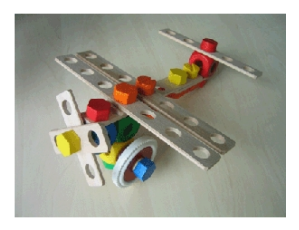
Figure 2: Assembled Baufix airplane

motions. Joint action may take several forms in the course of an interaction: for example, the robot may ask the user to provide assistance by holding one part of a larger assembly, or may delegate entire sub-tasks to be done independently. In the current version of the system, the robot is able to manipulate objects in the workspace (e.g., picking them up, putting them down, or giving them to the user) and to perform simple assembly tasks.