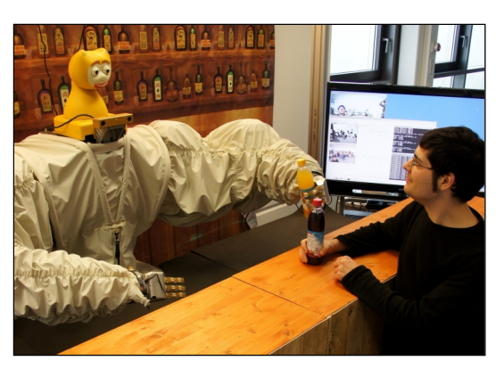
Figure 1: The JAMES robot bartender

© ACM, 2012. This is the author's version of the work. It is posted here by permission of ACM for your personal use. Not for redistribution. The definitive version was published in Proceedings of the 14th ACM International Conference on Multimodal Interaction (ICMI 2012), October 22–26, 2012, Santa Monica, California, USA.