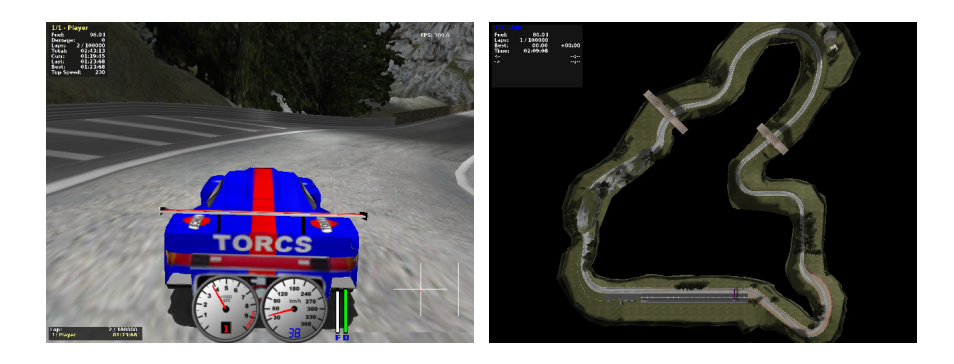
Fig. 4. The TORCS racing car simulator.

In order to test our algorithm's performance on a more complicated environment, we carried out experiments on the TORCS [22] car racing simulator. Observations are speed, steering angle, position and look-ahead-distance. The agent has to learn to drive and stay on the road while maintaining high speed. Its reward consists of the speed, but it gets punished for getting off the track. Maximum speed starts off with 10 km/h, and is gradually increased.