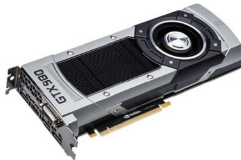
Fig. 2. Nvidia GPU card

The project will include following phases: