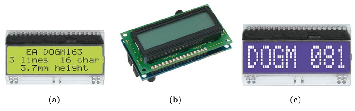
Figure 1: Different LC display modules

During the past exercises, we have acquired and processed various sensor values. However, our only output channels so far were LEDs and the debug console. LEDs are very limited when it comes to visualization of information and the debug console requires the presence of a host PC. This is why we will now focus on visualization of information using liquid crystal displays (LCDs). LCDs are available in many different forms and shapes (compare figure 1) and can be used to display text and/or graphics. In this lab course, we will however focus on a text-based LCD.