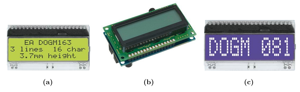
Figure 1: Different LC display modules

During the past exercises, we have acquired and processed various sensor values. However, our only output channels so far were LEDs and the debug console. LEDs are very limited when it comes to visualization of information and the debug console requires the presence of a host PC. This is why we will now focus on visualization of information using liquid crystal displays (LCDs). LCDs are available in many different forms and shapes (compare figure 1) and can be used to display text and/or graphics. In this lab course, we will however focus on a text-based LCD.